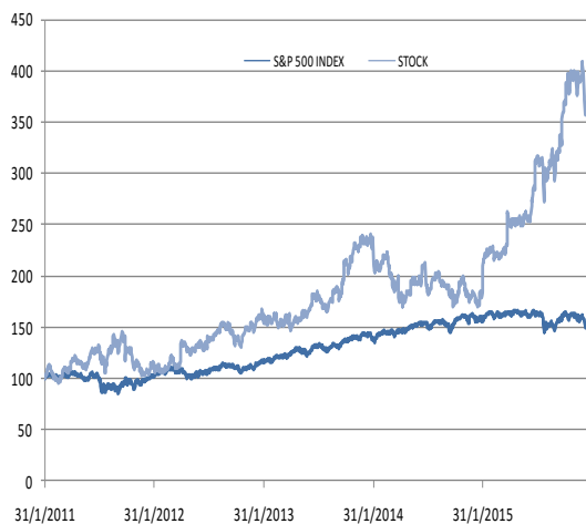
Stock Versus S&P 500 Index (Last 5 Years, Base = 100)

Note: Data based on price closes. Period as day/month/year.